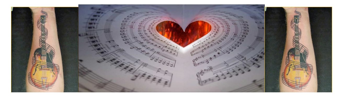
Field Observation #2 – Components in a Music Teaching/Learning Event